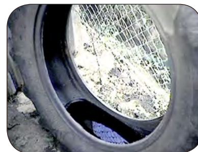
Recycle used tires or keep them protected from rain.