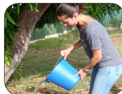
Drain & dump any standing water.