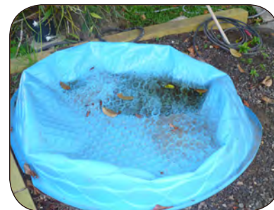
Drain water from pools when not in use.