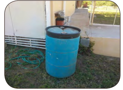
Keep rain barrels covered tightly.