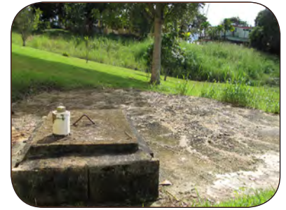
Keep septic tanks sealed.