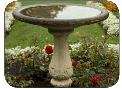
Weekly, empty standing water from fountains and bird baths.