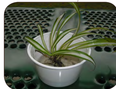
Put plants in soil, not in water.